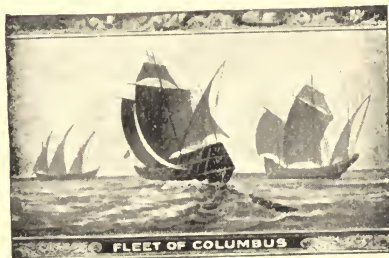
FLEET OF COLUMBUS